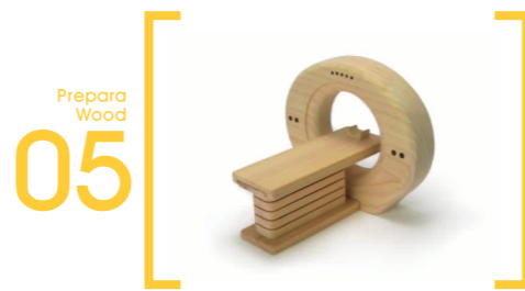
05 Prepara Wood

CT Mini=8.5cm×7.5cm×7cm S=18cm×19cm×17cm L=48cm×42cm×40cm Treatment table moves backwards and forwards.