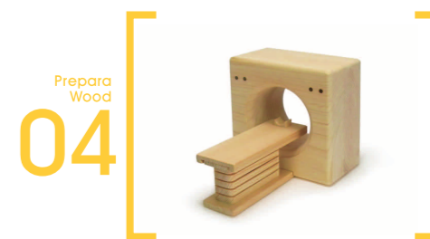
04 Prepara Wood

Surgery / Hospital Room Box S=30cm×23cm×20cm Hospital room side: equipped with beds and chests of drawers. Operating theater side: equipped with operating table, and large and small shadowless lights.