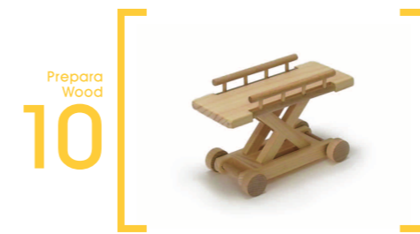
10 Prepara Wood

Wheelchair L=18cm×22cm×20cm Wheels move.