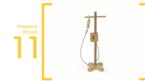
11 Prepara Wood

Stretcher S=12cm×5cm×6cm L=35cm×16cm×21cm Wheels move. Bed guards are also movable.