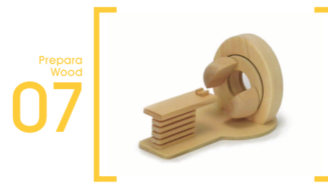
07 Prepara Wood

Radiotherapy Machine (LINAC) Mini=9cm×16cm×8.5cm S=20cm×18cm×35cm L=40cm×70cm×34cm Treatment table moves backwards and forwards. Irradiation part rotates 360 degrees.