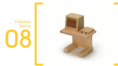
08 Prepara Wood

RI (Gamma Camera / Scintigraphic Camera) Mini=9cm×16cm×9.5cm S=20cm×25cm×35cm Camera part rotates 360 degrees and moves up and down. Examination table moves backwards and forwards.