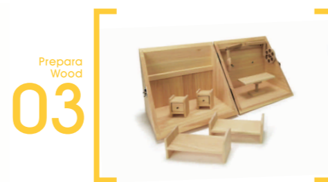
03 Prepara Wood

Examination Set (CT / MRI Set) S=20cm×25cm×20cm Equipped with stretcher, MRI, CT, console, and intravenous drip stand + storage box for all 5 items.