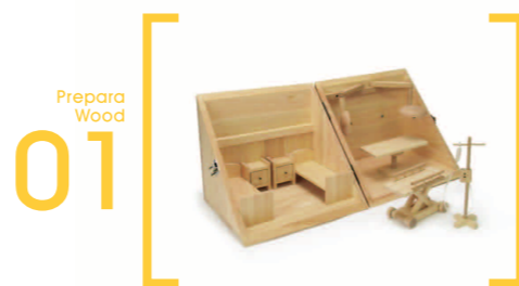
01 Prepara Wood

●Products are available in three sizes: Mini, S and L. Sizes differ slightly from product to product. ●Products use wood from Japanese cypress, beech, linden plywood, and Japanese Judas trees produced in Kanagawa and Yamanashi prefectures in Japan. ●Finished products are unpainted. Please enjoy the wood's natural warmth.