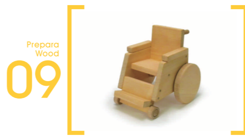
09 Prepara Wood

Console S=8cm×5cm×10cm Console for CT/MRI.